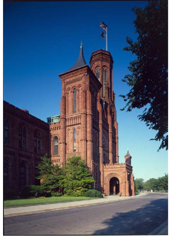
View of the Smithsonian Castle.

Federal appropriations provide the core support for the Smithsonian's museum functions, science efforts, and infrastructure, and are supplemented by trust resources, including private donations and grants.